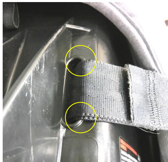
Look for damage to plastic seat body, especially where the straps pass through